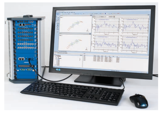
Monitor, keyboard and mouse connected to CPU for standalone operation