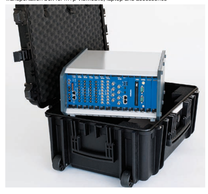
Transportation box for m+p VibMobile, laptop and accessories

protection if you carry your device. For very high shock and vibration exposure, for example during test runs in vehicles, we offer a shock-isolated mount in a strong steel box which has vapour-tight front and rear covers – also perfect for protected transport to the site.