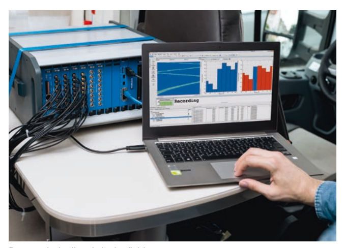
Data analysis directly in the field