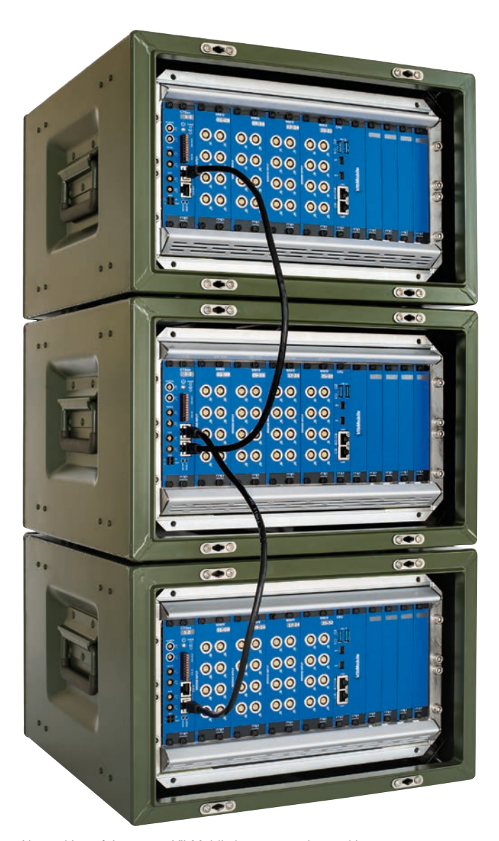
Networking of three m+p VibMobile instruments housed in ¾ 19" wide shock-proof boxes

Just take your measurements, do online analysis, review the results, store raw data and results, share the results with colleagues and continue your work in the lab or in the office using the field data. m+p VibMobile fulfills both the robustness and channel density criteria needed for optimal test and measurement productivity.