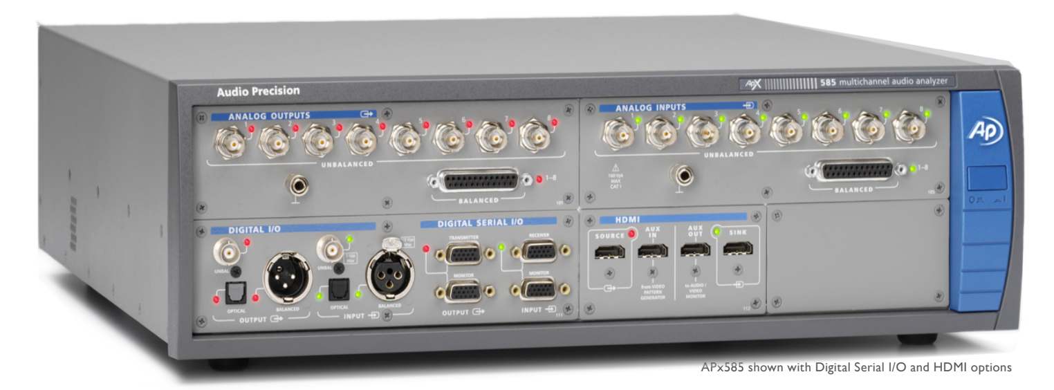
Ideal For Testing:

Next generation multichannel chip-level interface for audio