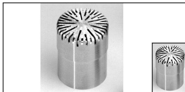
Fig. 1 1/2-inch Free-field Microphone Type 40AN (inset shows true size)

G.R.A.S. 1/2-inch preamplifiers (see data sheets for Types 26AG, 26AH, 26AJ, 26AK and 26AM) are also available for use with the Type 40AN. The mounting thread (11.7 mm - 60 UNS-2) is compatible with other available makes of similar microphone preamplifiers.